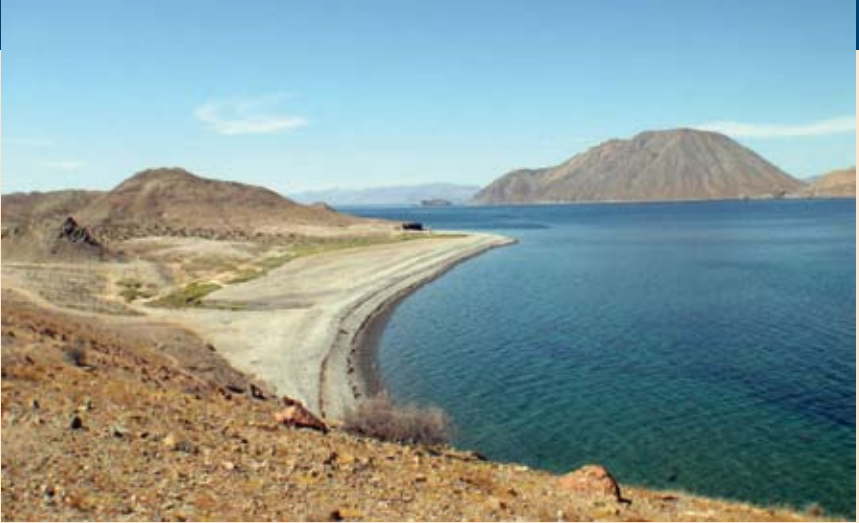
LOS ANGELES BAY