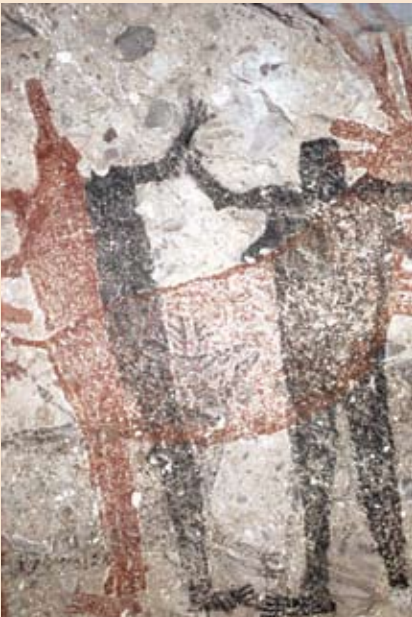
SAN IGNACIO CAVE PAINTINGS