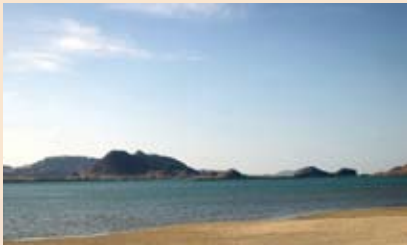
LOS ANGELES BAY

You can do sports fishing, camping, kayaking, surfing and windsurfing on the beach here.