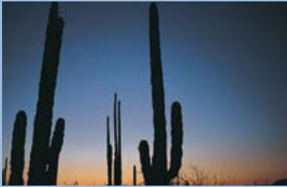
BAJA CALIFORNIA CENTRAL DESERT

This region is located in the northwest of México. It borders to the north on the United States and Sonora; to the south on Baja California Sur; to the west on the Pacific Ocean; and to the northeast on the Gulf of California.